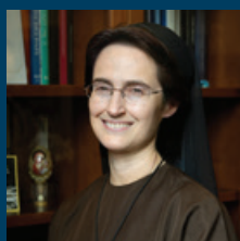
Sr. Raffaella Petrini, FSE Secretary General of the Governorate of Vatican City State