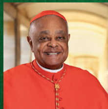
His Eminence Wilton Cardinal Gregory C '80 Archbishop of Washington